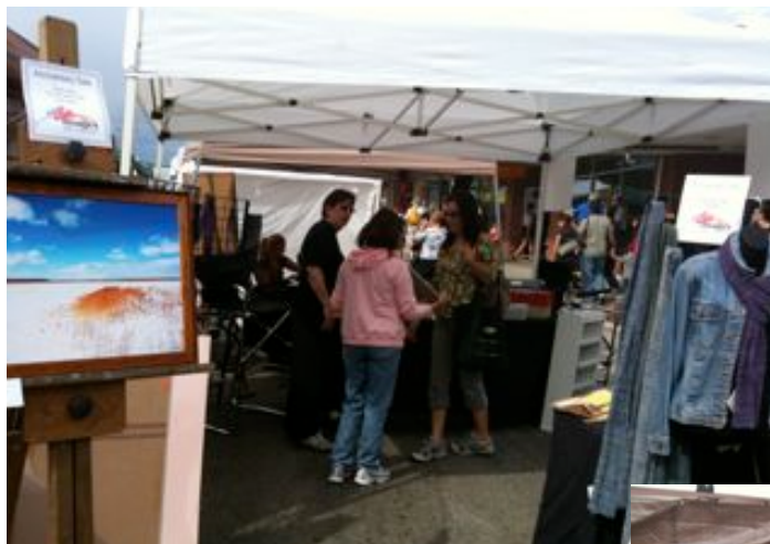
Images booth for Fall Festival